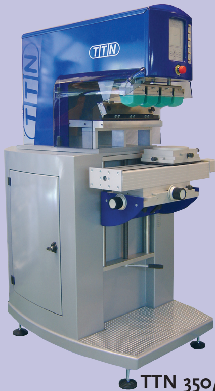
TTN 350/150 4 TC Open inkwell system