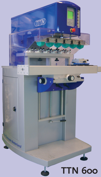
TTN 600 EKO 6 TC Closed ink cup system